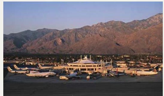
Nearby Palm Springs Airport