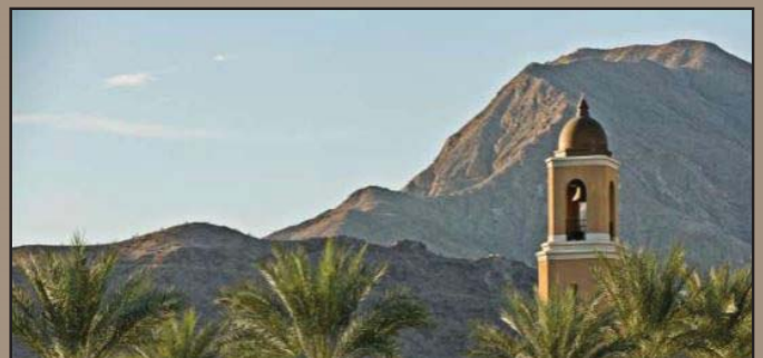
City of Cathedral City