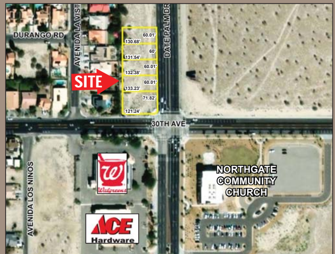
Zoomed In Aerial

For further information, please contact: