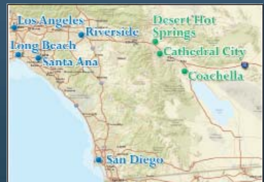
Southern California Vicinity Map