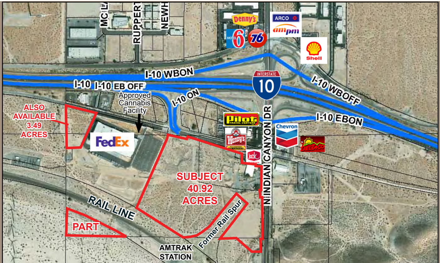
Indian Canyon Drive, South of Interstate 10 ♦ Palm Springs, CA