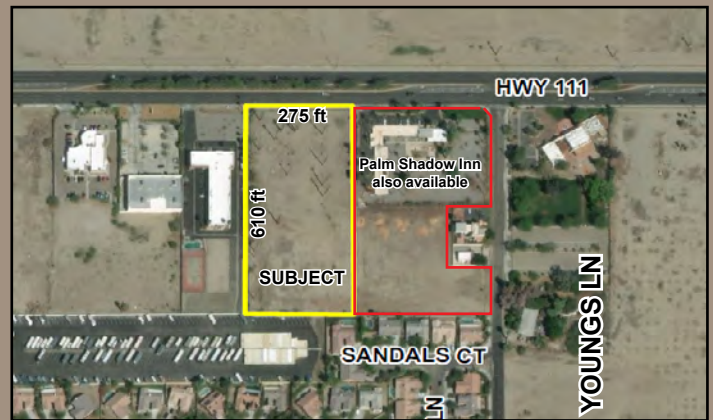
Zoomed In Aerial