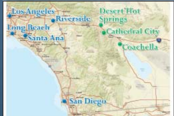
Southern California Vicinity Map

West Little Morongo Rd., S Dillon Rd. Desert Hot Springs, CA