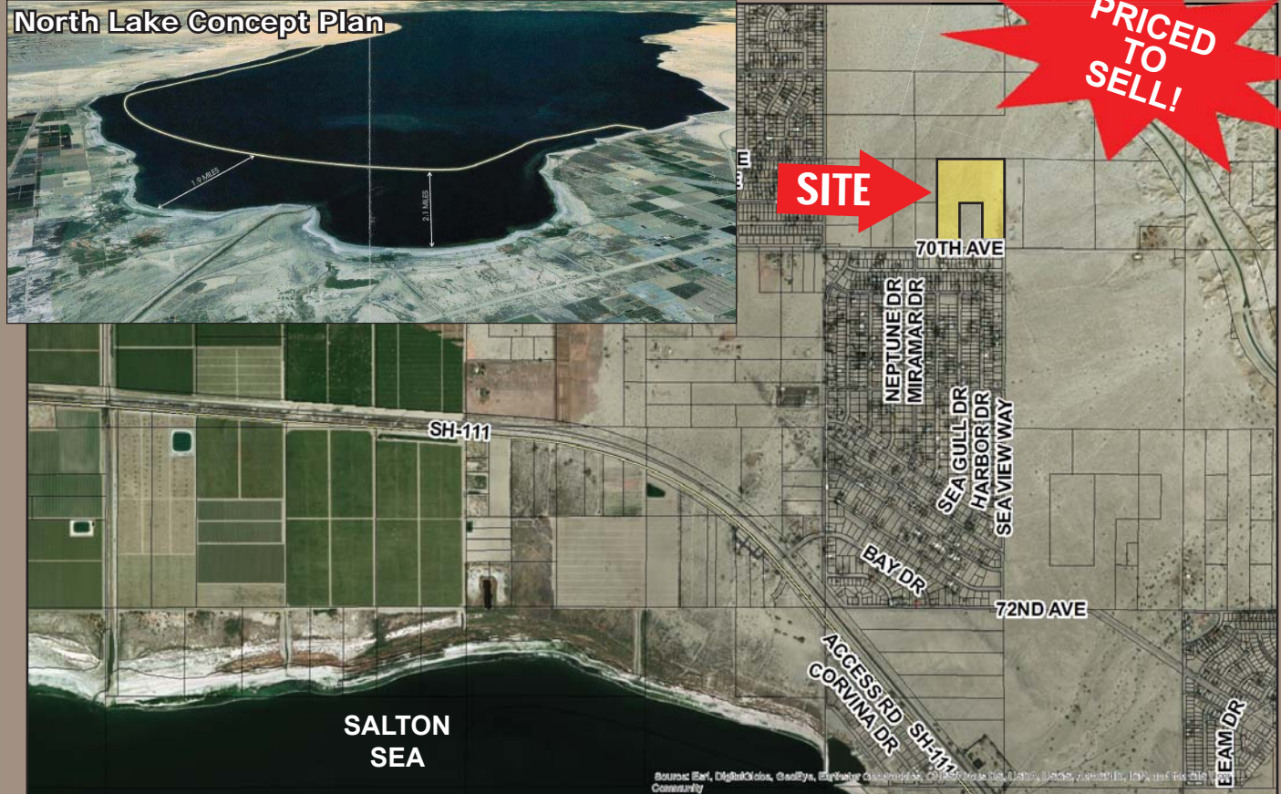
North Lake Concept Plan

North 70th Avenue, West Sea View Way ► North Shore, CA